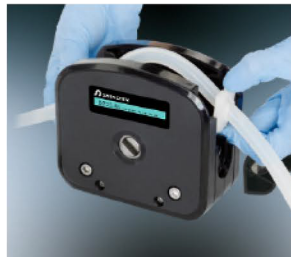
B. Put the tubing with cartridge or connector into pump housing.