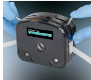
C. Install the upper block, put down the levers to lock the block.