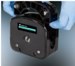
A. Lift both side levers, take off the upper block.