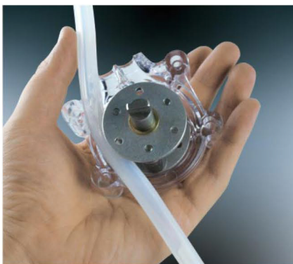
A. Disassemble the pump head, and press the tubing on the rollers.