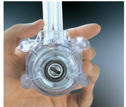
C. Tighten the tubing aptly, and load the other half pump head body.