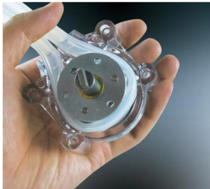
B. Make the tubing go around the rollers one cycle, and merge it on the exit.