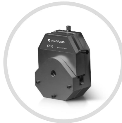
YZ35 (Aluminum Alloy)